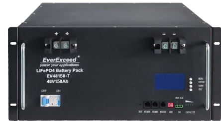
*the LCD display is optional

EverExceed LiFePO4 solutions are more advanced, highly efficient and has many advantages over the traditional Lead Acid technology.