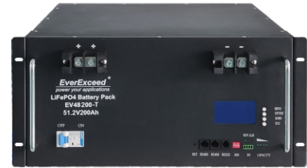
*the LCD display is optional

lithium iron phosphate (LiFePO4) battery Your best power choice for Telecom energy storage system!